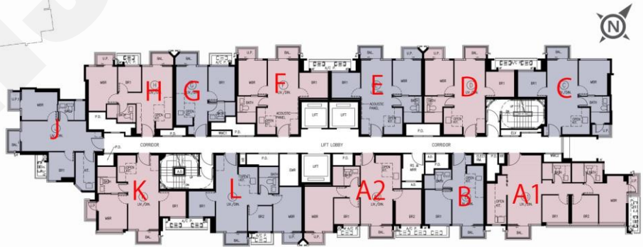
RISKARS TOWER 2B RISKARS 第28座