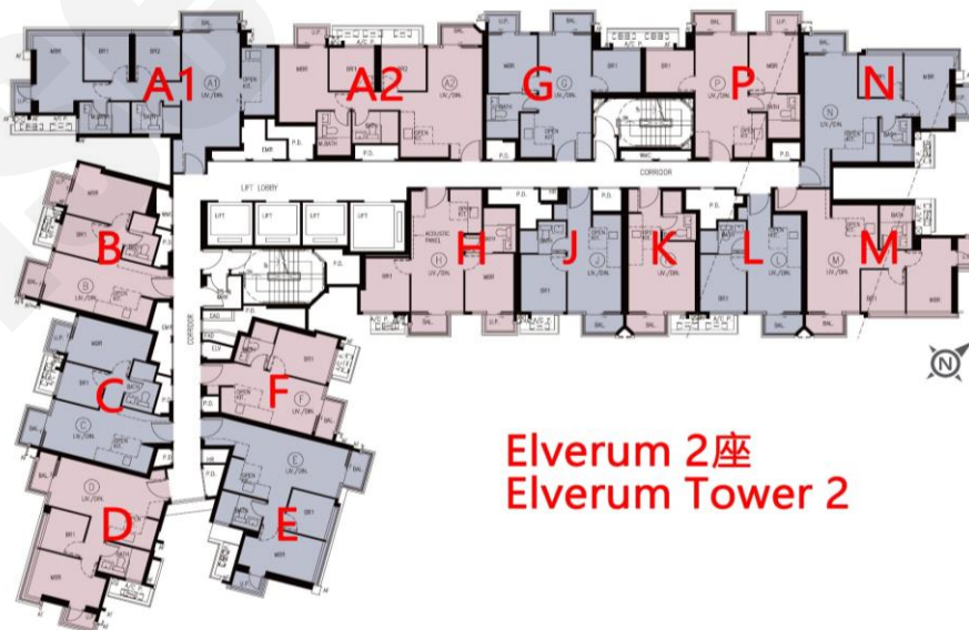
Elverum 2座 Elverum Tower 2